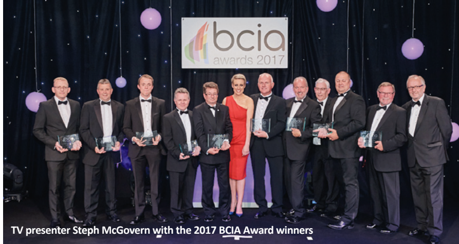
TV presenter Steph McGovern with the 2017 BCIA Award winners